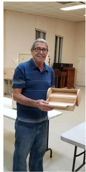
James Nauman: Tambour Top & Drawer Bread Box