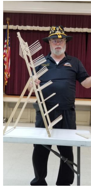
Bill Rizi: project idea for someone. to sell to a local shop