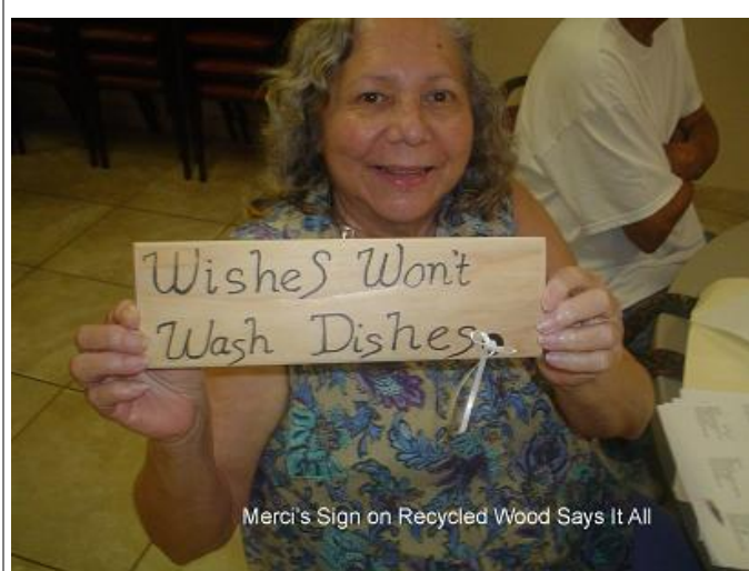
Merci's Sign on Recycled Wood Says It All