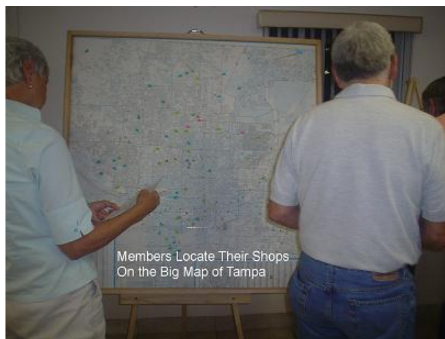
Members Locate Their Shops On the Big Map of Tampa