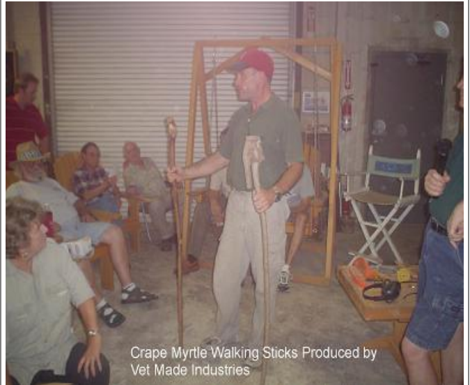
Crape Myrtle Walking Sticks Produced by Vet Made Industries

The workshop of Vetmade Industries is operated by Black Bear Woodworking, Inc. Housed in a 2500 SF high-bay warehouse at 1517 West Cypress St in West Tampa, FL 33606, Vetmade employees learn the craft of woodworking, along with production of quality furniture. In order to make the shop "liveable" in the blazing Tampa Summer heat, we installed a 5-ton air-conditioning unit; which not only keeps the temperature comfortable, but also keeps the relative humidity at a level suitable for storage of wood. Most of machinery is old and was carried around the world by the director John Campbell during his Army career. The short-term goal of Vetmade is to upgrade machines and add an additional furniture production line.