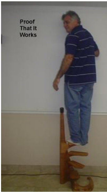
Proof That It Works