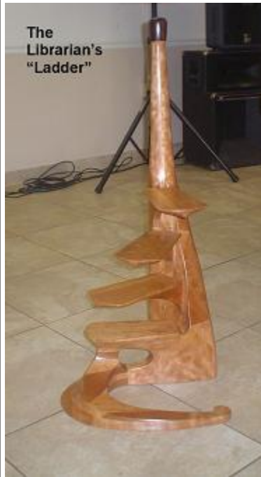
The Librarian's "Ladder"